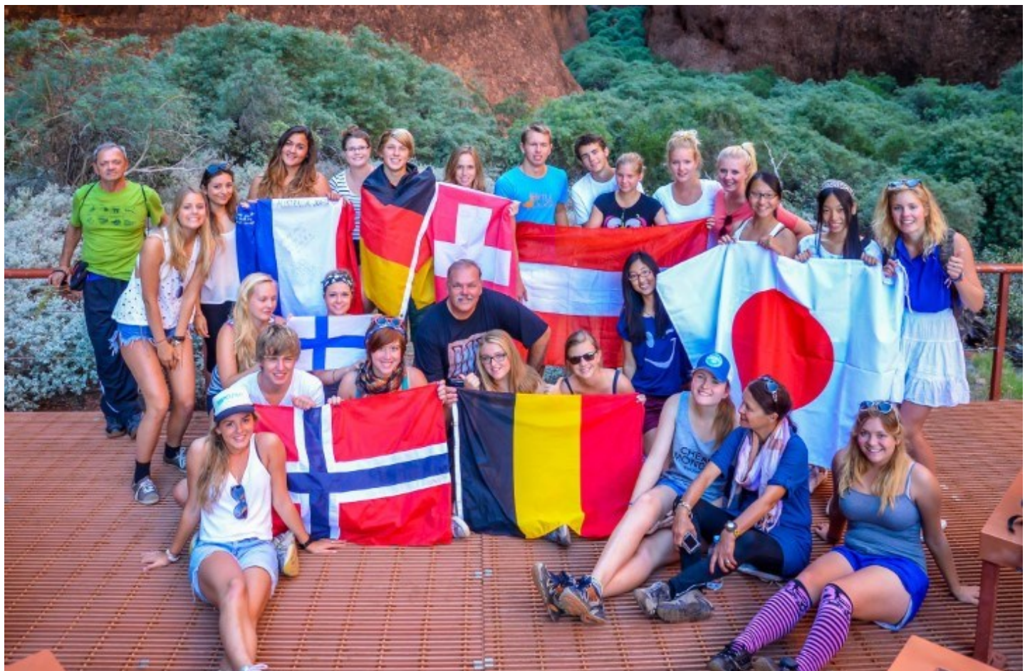
Fond memories from the Capricorn Ramble trips with the Inbound Exchange Students