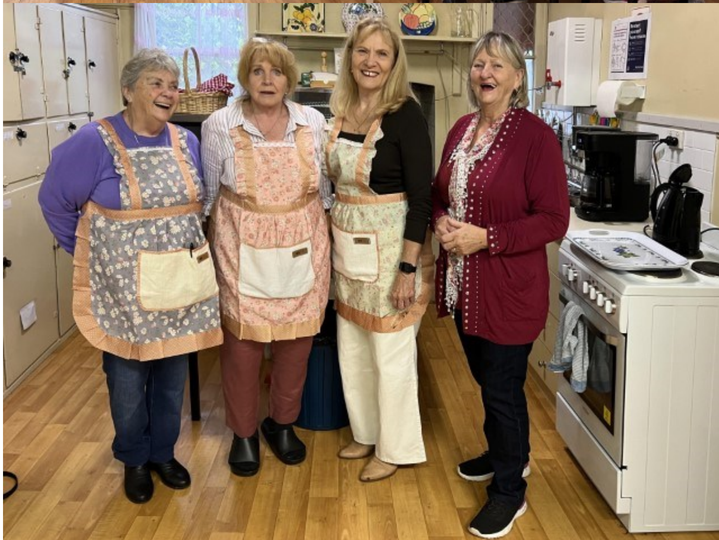
Scone Time at Marthaville Cottage every Friday morning is a real success. We have Rotarians and Friends of Rotary who volunteer and provide an excellent morning tea with a huge smile.