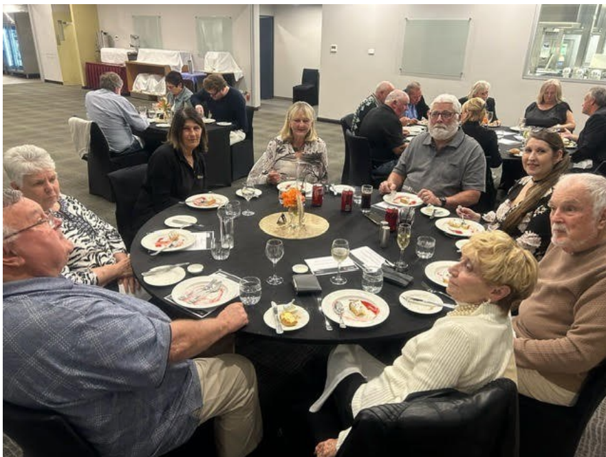
Looks like it was a fun night at the Kurri Kurri dinner put on by the TAFE students