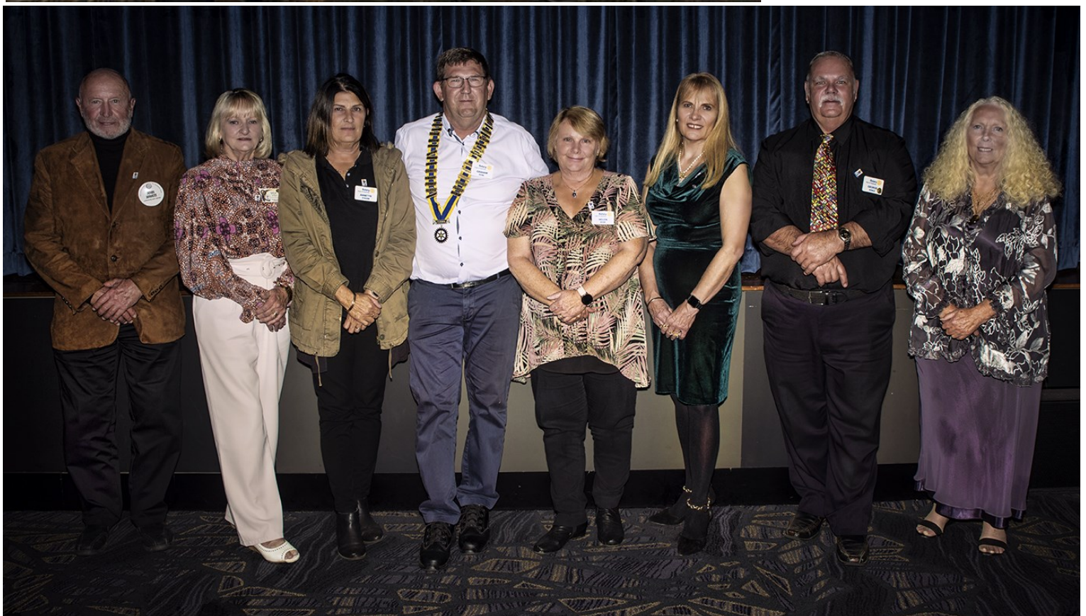
Photo of the new board members for 2023-2024, which was featured in the Advertiser